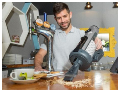
Handy 2-in-1 Combi Tool